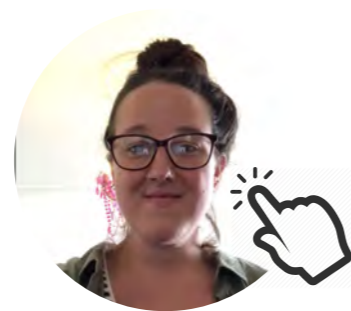
Ione, United Kingdom